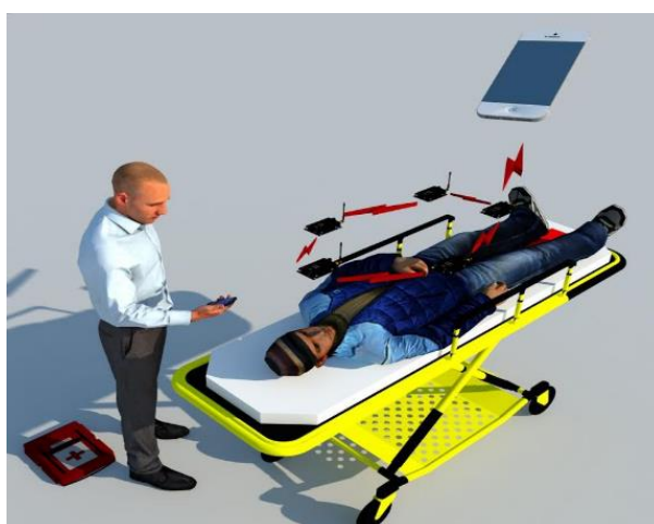
Figure 2. Wireless body sensor network communicating through a mobile phone.

In emergency situations, the integration of a WBSN and a smartphone can enhance the existing medical emergency procedures and minimize the possibilities of permanent injury or death. A basic WBSN-technology implemented in an emergency scenario is shown in Figure 2. It shows a body sensor network where a paramedic is connecting a patient. Sensors will communicate wirelessly to the mobile device and the mobile will capture parameters for subsequent delivery to the servers. Mobile networks help to reduce time and facilitate decision making in these circumstances.